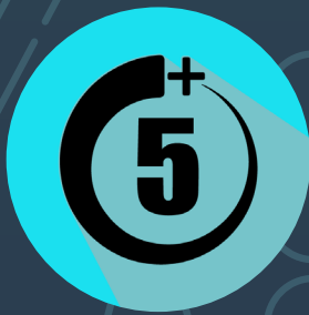
+5 Years Lifetime