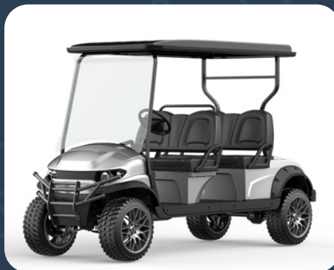
New Front Face