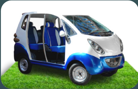
ELECTRIC STREET CAR