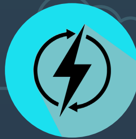
Higher Charge-discharge Efficiency