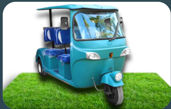
ELECTRIC 3 WHEELED GOLF CART