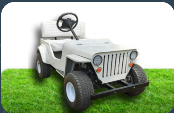
ELECTRIC CHEVIE JEEP