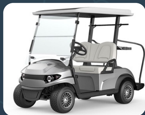
New Front Face