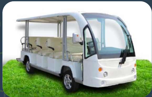
E-BUS 14 SEATER BUS